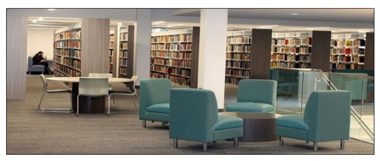
Roberts Library