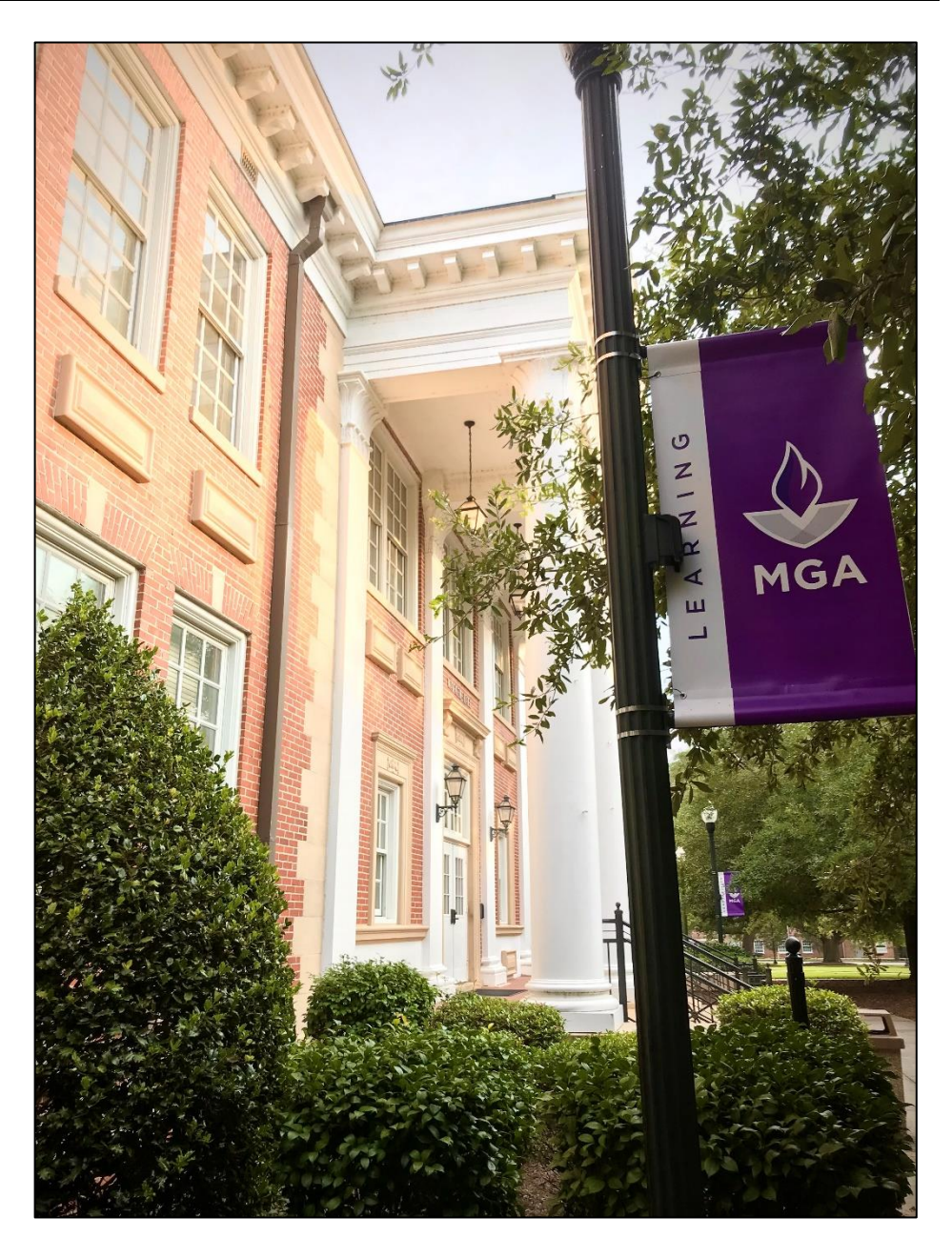
Walker Hall

That is combined with top-notch faculty who are engaged with their discipline at-large, our community