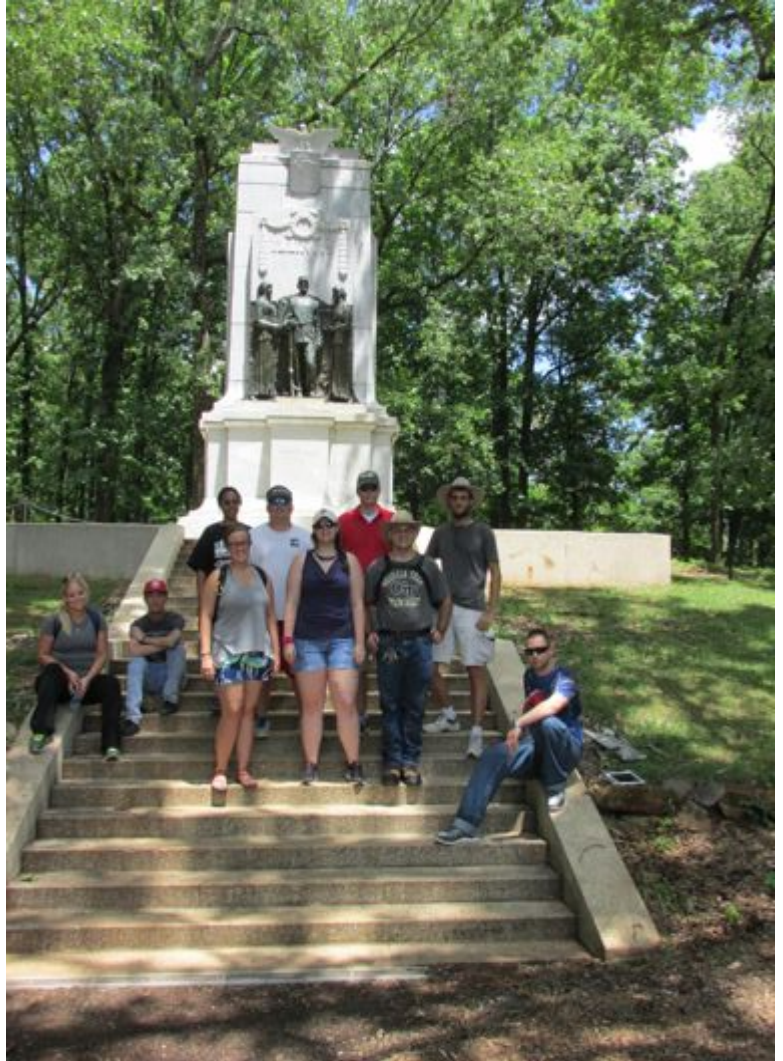
The College on the Move's group photo.

The trip concluded with a walk in the very rooms where Alabama seceded and the Confederate States of America were created. Awaiting the return home, the exhausted students were barely able to keep their attention on the naval presentation in Columbus. No deaths were reported, but there were certainly casualties due to bug bites along the way. The Union won of course and it was a grand success. Watch for updates about next year's tour.