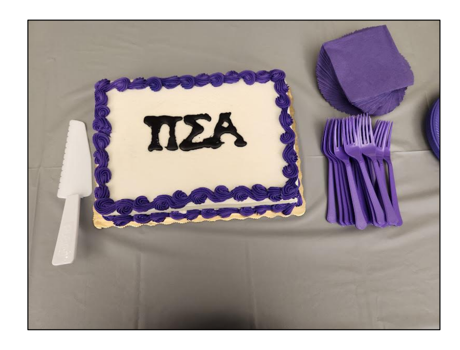
Celebratory cake for the Spring 2023 Pi Sigma Alpha initiation.