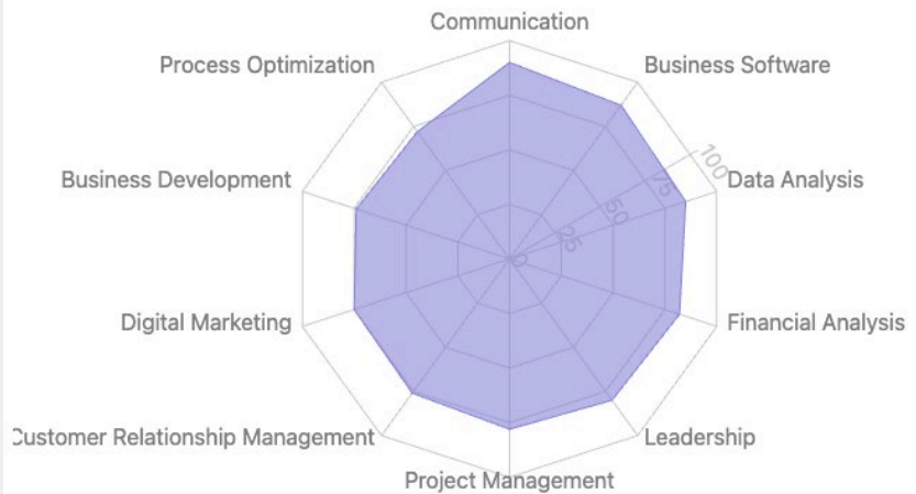
Skills Demand Analysis

By remaining responsive to these shifting trends and proactively evolving the curriculum and student experience, the BSBA program is committed to maintaining its role as a vital contributor to student success and regional economic development.